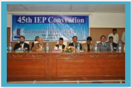
A view of the Stage