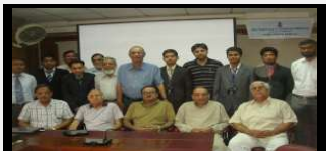
Group Photo with NED Students