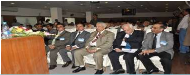
Dr. A.Q.Khan, NI & Bar HI with IEP Officials