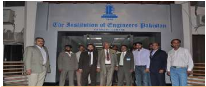
Group Photo with the Chief Guest at the main entrance of IEP Building

The Convention was spread over Five Technical Sessions which were conducted simultaneously in the five newly developed facilities at 5 th floor, IEP Building. Following is the details.