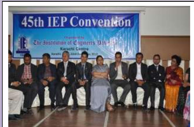
A Group of Foreign Guest