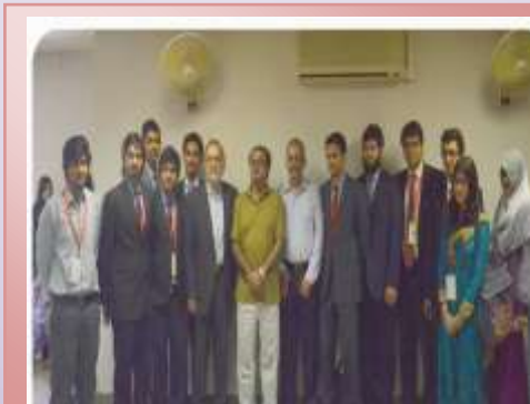
NUST students with President, IEP