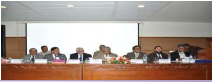
A view of Stage, Dr. A.Q.Khan NI, Bar HI, Chief Guest of the 45th Convention is sitting in the Centre