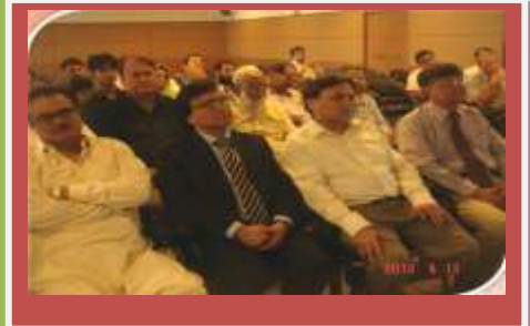
A view of the Participants of the Condolence Meeting