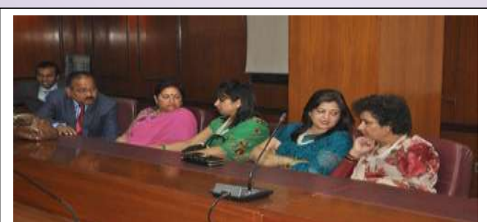
Guest from Nepal Engineers Association