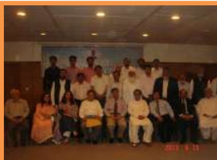
Group Photo of the participants of the Condolence Meeting