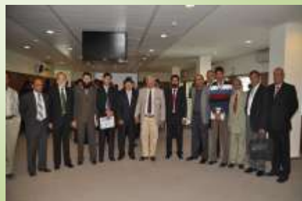
Group Photo on the occasion of Seminar on Thar Coal