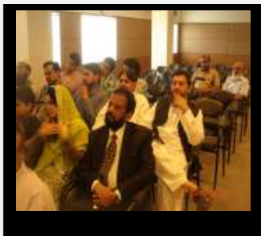
A view of the participants of the Condolence Meeting